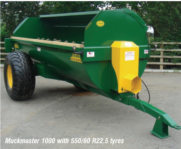
Muckmaster 1000 with 550/60 R22.5 tyres