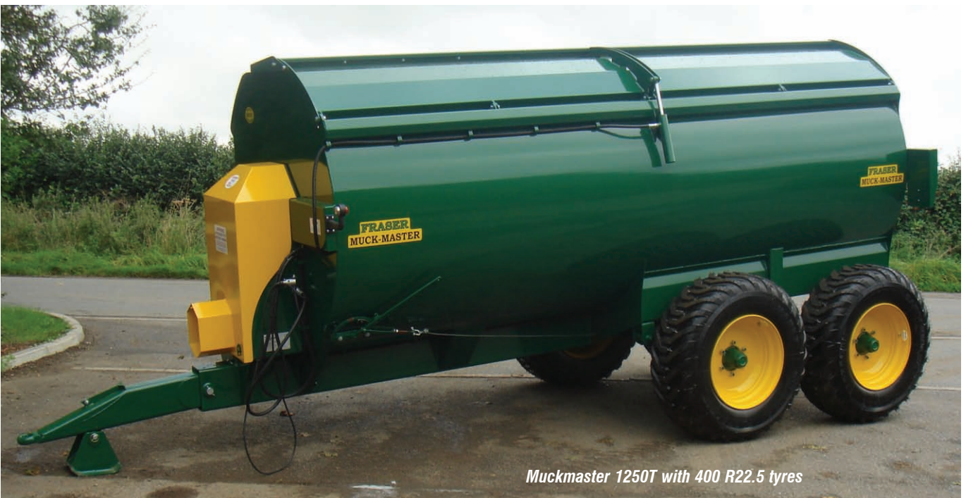
Muckmaster 1250T with 400 R22.5 tyres