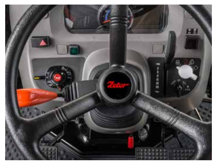
The easy-to-read LED dashboard displays operating data, such as engine speed, temperature, fuel level, time, PTO, etc.