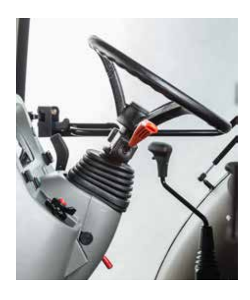
The HORTUS HS is equipped with a hydraulic reverser (PowerShuttle), which allows to conveniently change the driving direction without using the clutch pedal.