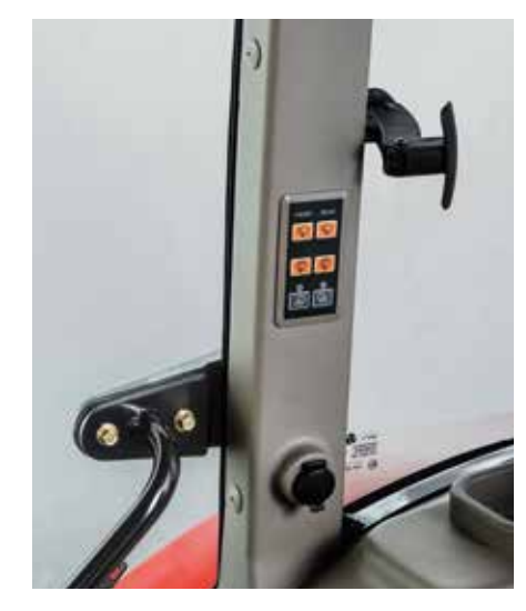
The control panel for lights and wiper is located on the right column so that all buttons are within easy reach of the driver.