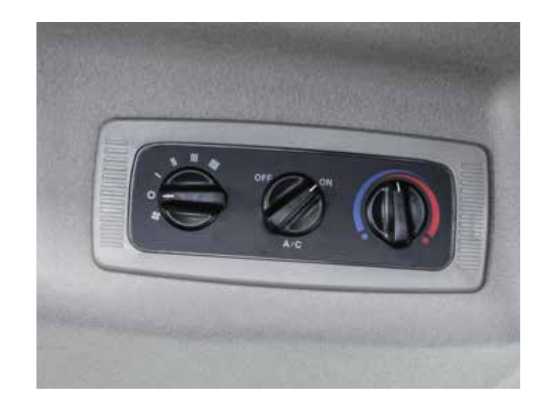
The tractor is equipped with heating, air conditioning and AM/FM/CD radio.